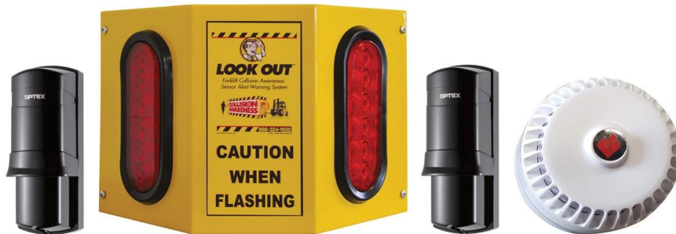
Fit Pkg 1 70' S