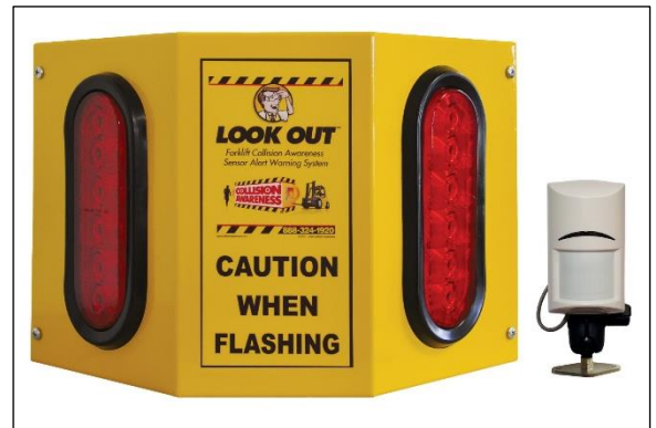
Overhead Door Basic - Double