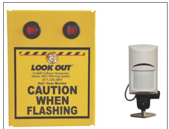
Hall Door Basic