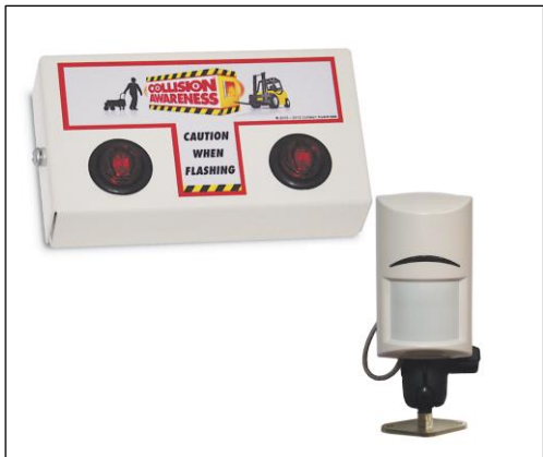
Office Door Basic