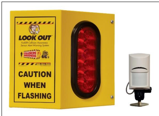
Overhead Door Basic - Single